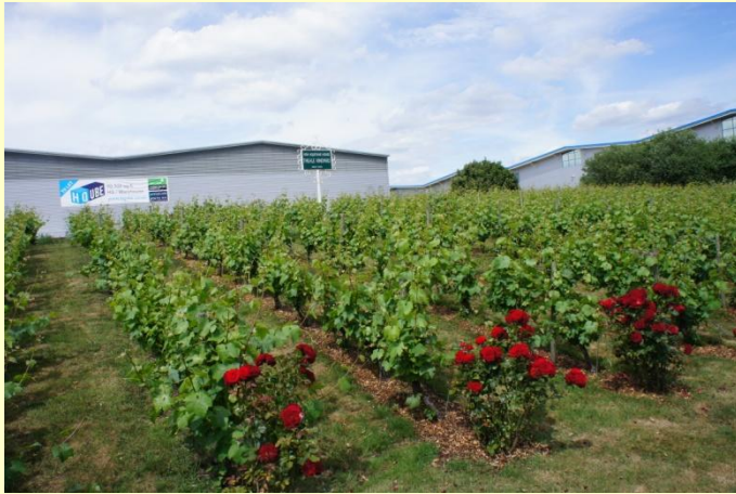
Theale Vineyard blooms in the June sunshine